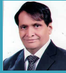
Shri Suresh Prabhu

6th Executive Director, United Nations Environment Program